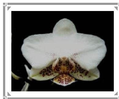
Phal ( stuartiana x Elise de Valec) x Dtps. Beautiful Jewel' Sarah'

This mahogany and yellow flower is often featured on orchid growers web sites on the internet.