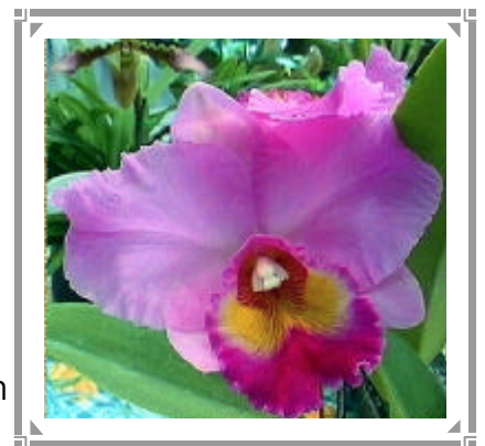
Blc. Sylvia Fry "Wallacia"

Although several cultivars of this orchid have been awarded, Blc. Sylvia Fry 'Wallacia' received the most points - 86.4 and received an FCC/AOC in 1971, the highest points for Cattleyas. However Blc. Sylvia Fry 'Supreme' remains the favorite.