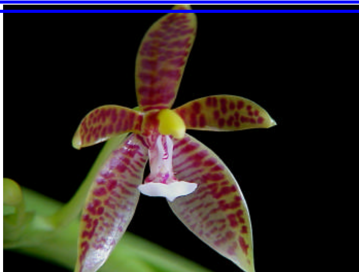
Phal. Cornu cervi

It does like some warmth and I grow mine sitting on top of a hot water service in my Cattleya house