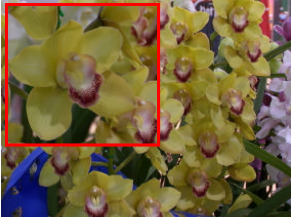
Moss Bray's Grand Champion Cymbidium