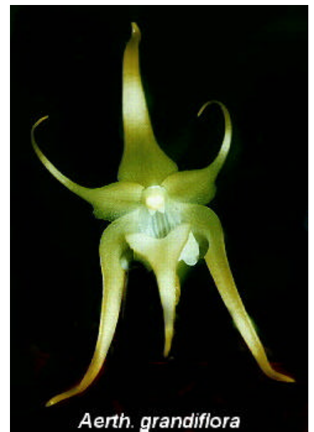
Aerth. grandiflora Sp. Aeranthus grandiflora

I grow my plant with my Cattleyas toward the top of the house where it is warmer