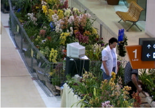
Our Spring Show at Westfield Marion