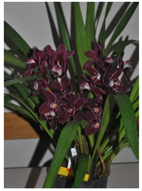
Popular Vote: Cym. Willunga Regal 'Red Velvet Show' Gary Clark