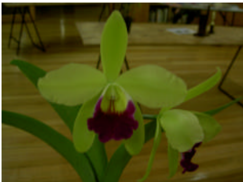
Eplc. Mae Bly 'Emy' - Heather Engelhardt

Flower of First Division: Epilaeliocattleya (Eplc.) May Bly 'Emy' benched by new member Heather Eaglehardt. The plant carried one inflorescence with two 130mm wide flowers. The sepals and petals were greenish yellow shading to yellow at their base and the attractive labellum was yellow at the base with the outer half being bright purple.