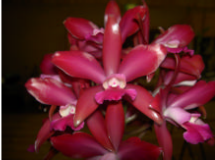
C. Valentine Day 'Lisa' - Peter & Geraldine Flavel

Flower of Open Division and Flower of the Night: C. Valentine Day 'Lisa' benched by Peter and Geraldine Flavel. This well grown plant carried a single inflorescence with 15 flowers that were between 80mm and 90mm across. The glossy flowers had vibrant deep purple sepal and petals that became paler at their base. The light lavender side lobes of the labellum curved up over the column and the prominent flat mid-lobe was bright purple.