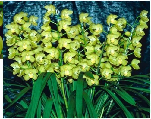
Cymbidium One Tree Hill 'John's Quest' AM/OSCOV