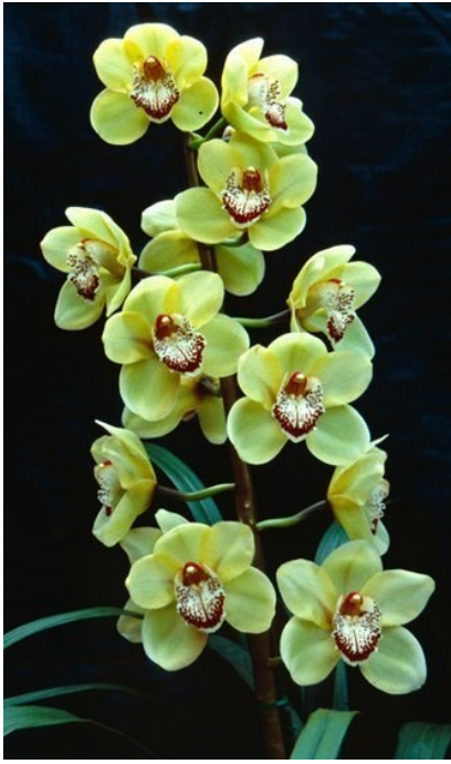
Cymbidium Kimberley Winter 'Sunbound' AM/OSCOV