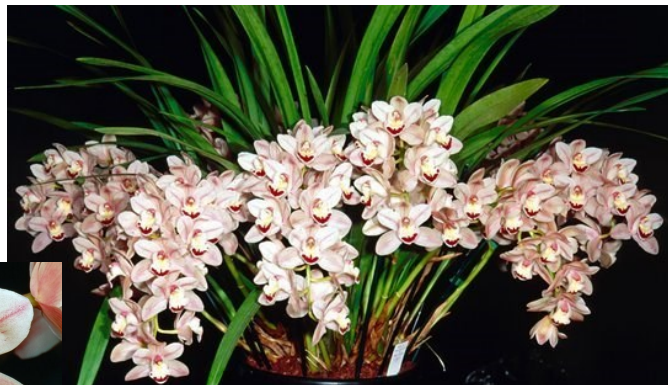
Cymbidium Careless Heart 'Cutie Pie' HCC/OSCOV CC/OSCOV