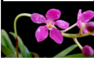
Sarc. fitzgeraldii 'Kuitpo' x Cherie 'Bullseye' Red Rose