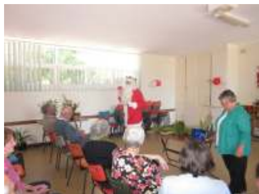
Father Christmas arrived with some gifts for members.