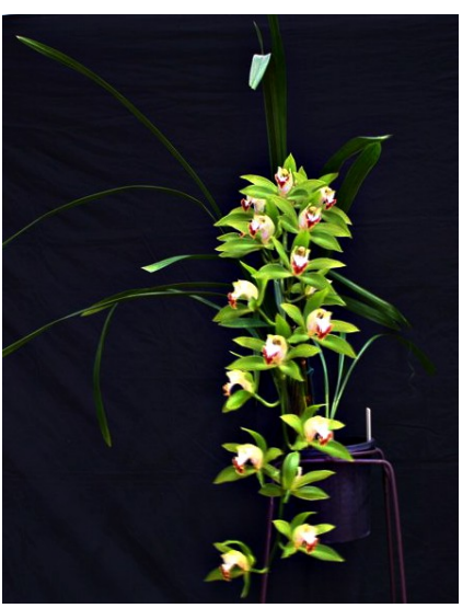
Champion Cymbidium 60 – 90mm: Cymbidium Gentle Touch 'Bon Bon' grown by Oui Ju & Michael Willoughby. One upright inflorescence boasting 23 green flowers, a white labellum burgundy patterned. A very charming orchid.