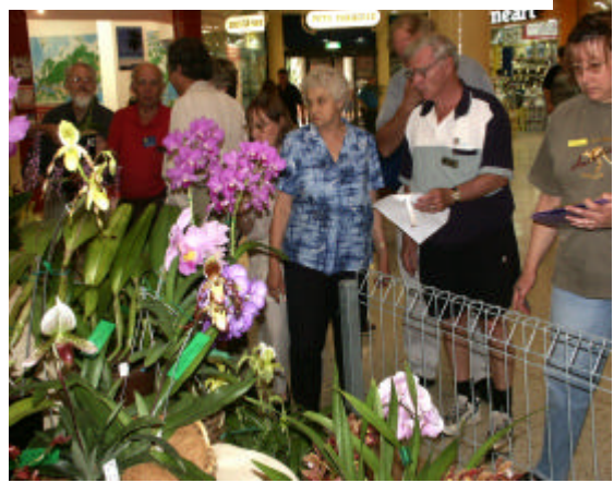
Judging In progress