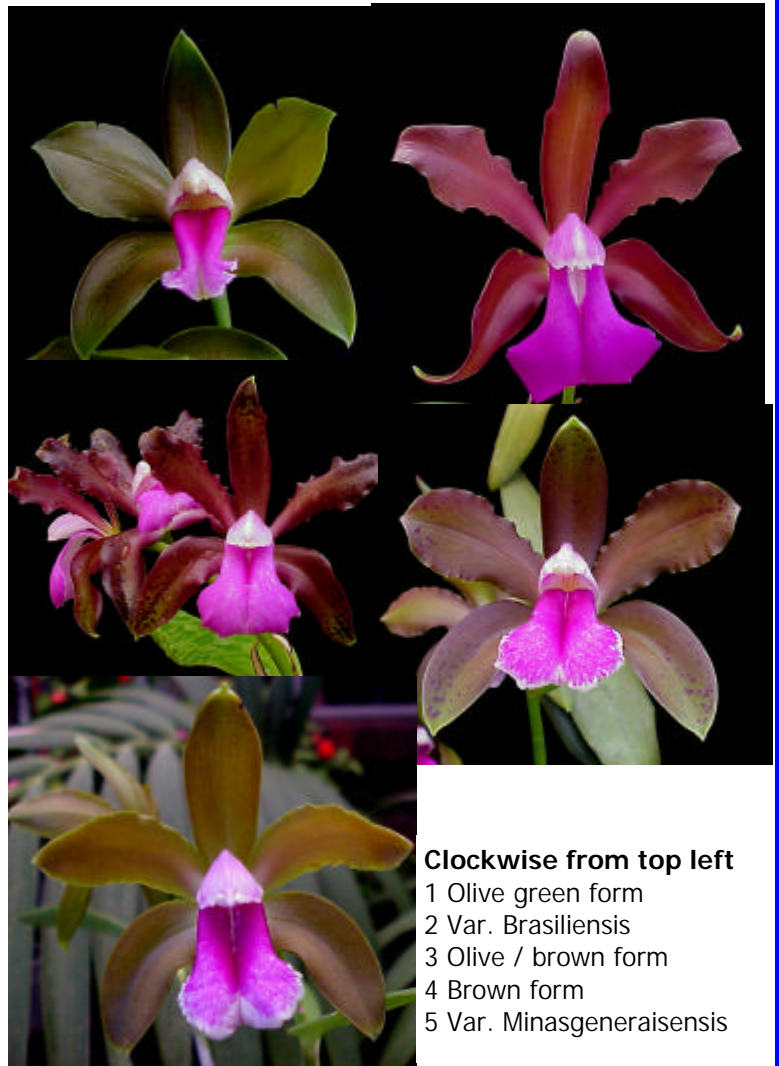
Clockwise from top left