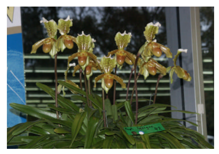
Helmut Gerber's Grand Champion Orchid Paphiopedilum insigne