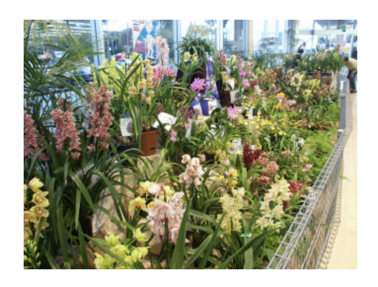
Our Display at the Pasadena Shopping Centre