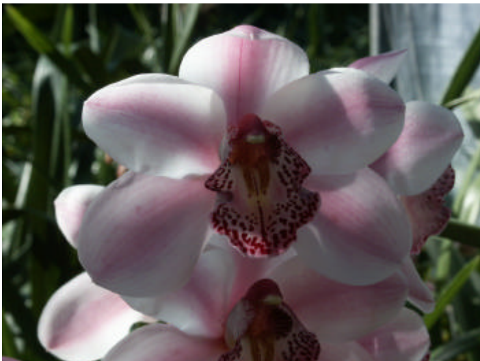
Geof's personal best in breeding